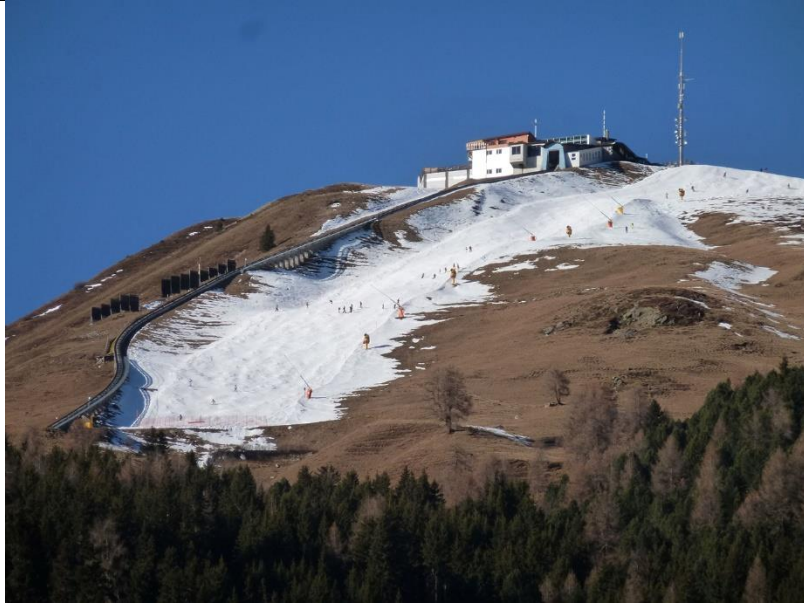
Figure 1 - Source, Carbon Brief.

Task 7 - https://theweek.com/news/sport/959422/climate-change-alps-end-of-skiing - Outline the how bad the problem of a lack of snow is from the first paragraph, including 5 pieces of key data.